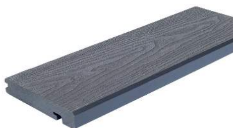
EvoTimber® Core Edge Board Dimensions: 145mm x 24mm x 3600mm