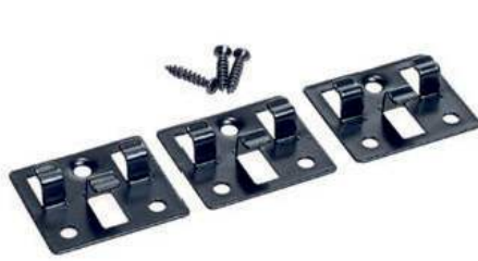
EvoTimber® Metal FastClip Set 100 units per box

Need help? Call us on 01530 382 185 or email enquiries@evotimber.com