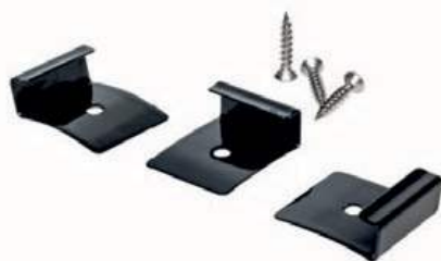
EvoTimber® Starter Clip Set 100 units per box