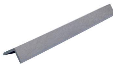
EvoTimber® Core Corner Trim Dimensions: 60mm x 40mm x 3600mm